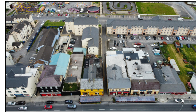
CENTRAL LANE AERIAL IMAGE - 03