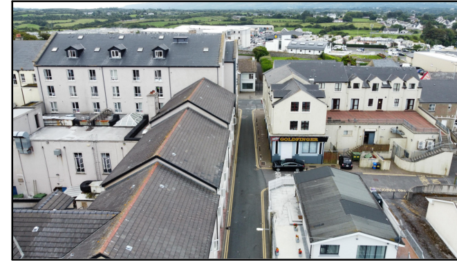
CENTRAL LANE AERIAL IMAGE - 02