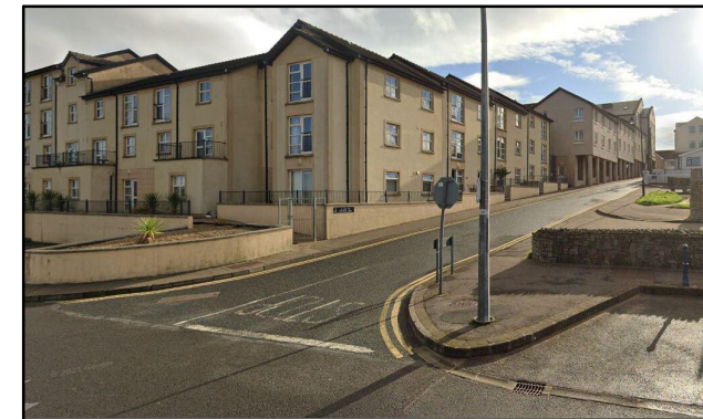
CENTRAL LANE ATLANTIC WAY ENTRANCE