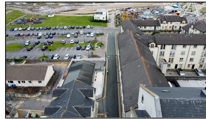
CENTRAL LANE AERIAL IMAGE - 01